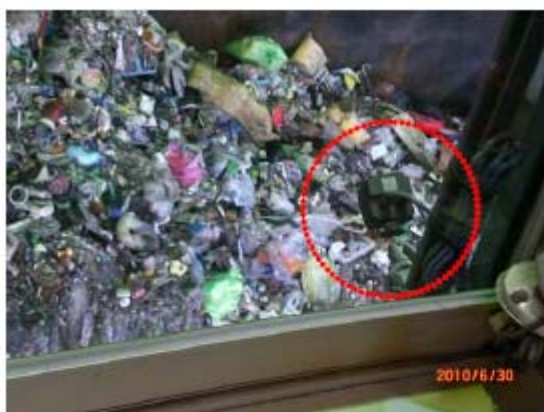
▲ Install at 10m from the bottom of waste pit