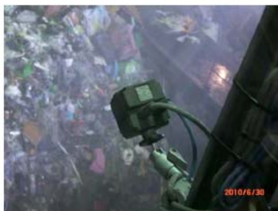
▲ Monitoring whole area by one TP-L