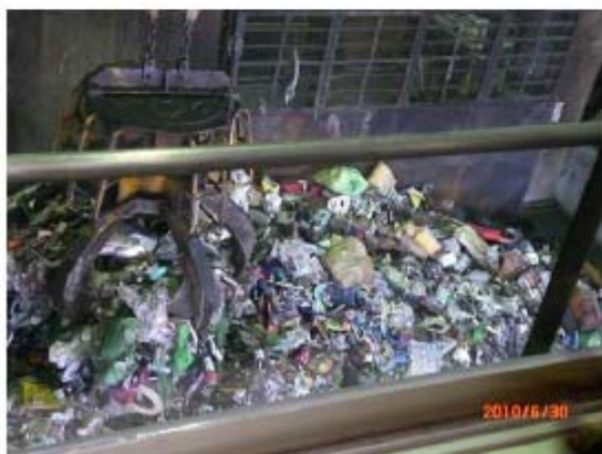
▲ Waste pit