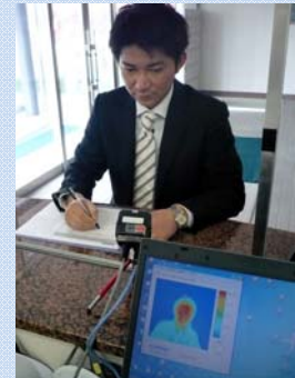
▲Temperature monitoring at reception.

Simplified clinical thermometry checker with thermal imaging sensor is just beginning to be adopted for prevent the spread of the new strain of influenza at the place where many people going in and out.