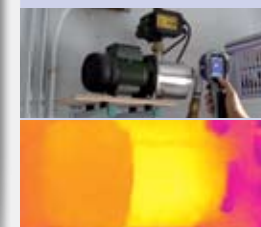
Inspection of this water pump shows no problem. The infrared image verifies that there is water in the pump cylinder and there is no danger of overheating the pump.