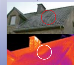
The infrared inspection locates missing insulation in the roof. This can now be repaired and further energy loss prevented.